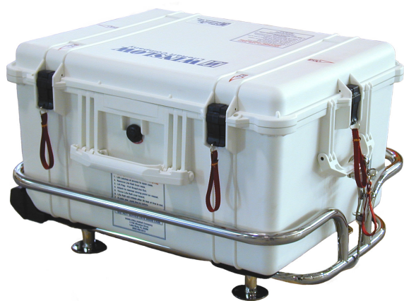
WINSLOW Pelican® Pac 8 Person Ultra Light Offshore With Cradle As Shown Above: 25" x 20 1/2" x 16 1/4" Without Cradle: 25" x 20" x 14"