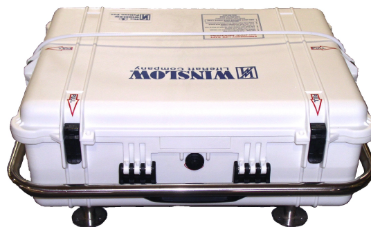
WINSLOW Pelican® Pac 4 or 6 Person Ultra Light Offshore With Cradle As Shown Above: 25 1/2" x 22" x 10 1/2" Without Cradle: 23 1/4" x 19 3/4" x 9"