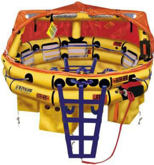
→ Front View Closed Canopy