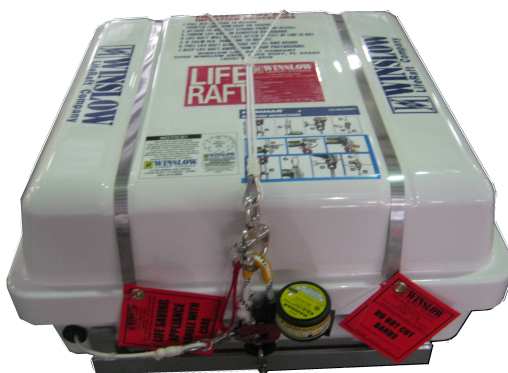
Low Profile Traditional Marine Canister, UV Inhibiting With Cradle & Hydrostatic Release As Shown Above: 25" x 25.5" x 14 1/2" Without Cradle: 25" x 25.5" x 12 1/2" With Cradle: 25" x 25.5" x 14 1/2"