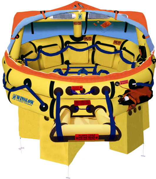
→ Front View Closed Canopy w/ Clear, Fixed View Ports