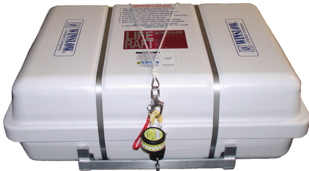
Low Profile Traditional Marine Canister, UV Inhibiting With Cradle & Hydrostatic Release As Shown Above: 25" x 34" x 14 1/2" Without Cradle: 25" x 34" x 12 1/2" With Cradle: 25" x 34" x 14 1/2"