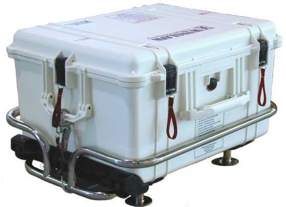
WINSLOW Pelican® Pac 4 or 6 Person Offshore With Cradle As Shown Above: 25" x 20 1/2" x 16 1/4" Without Cradle: 25" x 20" x 14"