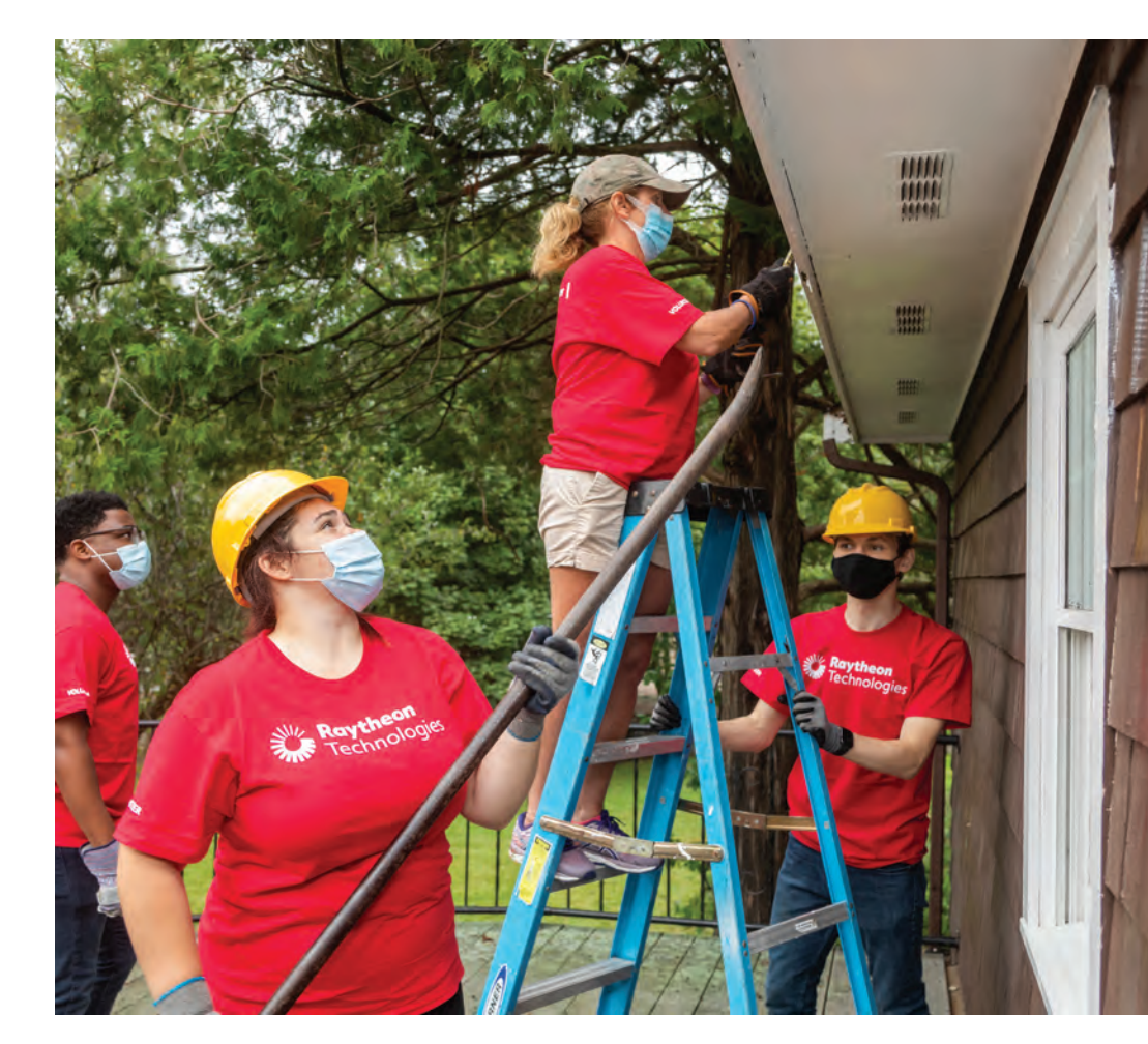
Members of Raytheon Technologies ERGs help rebuild a farmhouse at Ironstone Farm in Andover, Massachusetts, for weekend veteran retreats. The farm offers equine therapy for veterans and children with special needs.

Women: We provide women at Raytheon Technologies with the tools that enable their successful development and advancement across all levels of the organization.