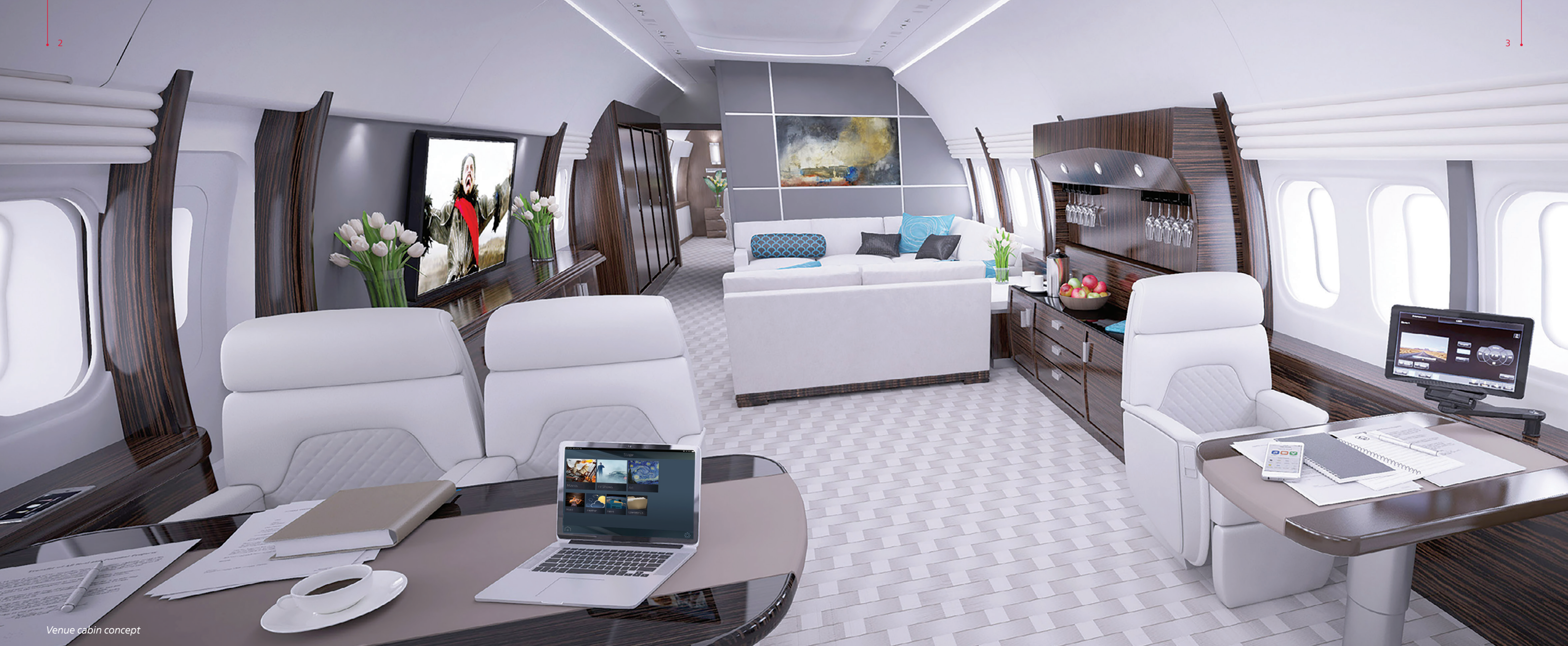
Venue cabin concept