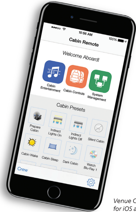
Venue Cabin Remote app for iOS and Android devices