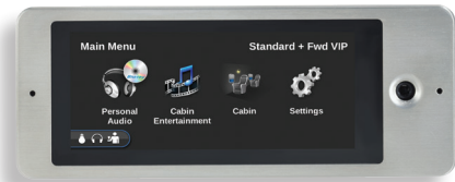
Touchscreen switch panel

Touchscreen switch panel – With optimized design for installation and usage near your seat, our touchscreen switch panel provides comprehensive seat and cabin controls. It incorporates state-of-the-art technology, dynamically supports VIP and standard configurations, and can default to a flight