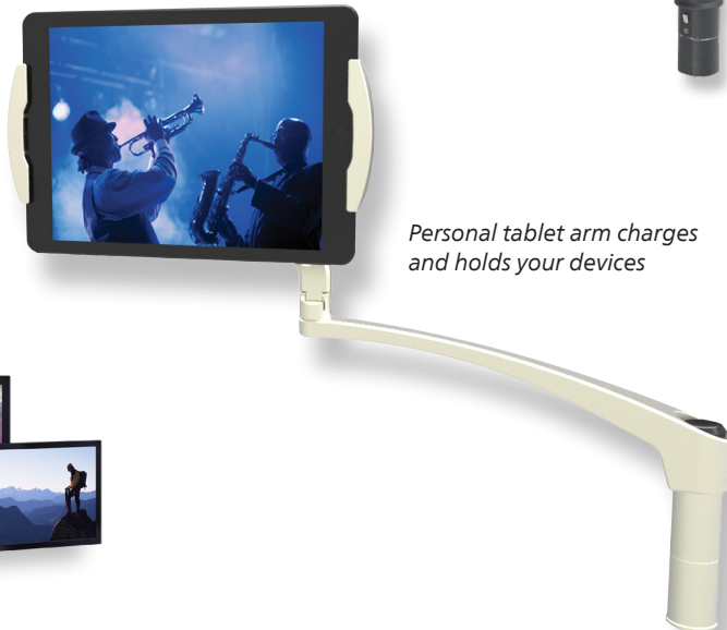
Personal tablet arm charges and holds your devices

Venue Cabin Remote app – Provides complete cabin control management from your iOS and Android devices. The app dynamically recognizes the configuration of your cabin and enables you to control lighting, shades, temperature and entertainment, including your Airshow moving map.