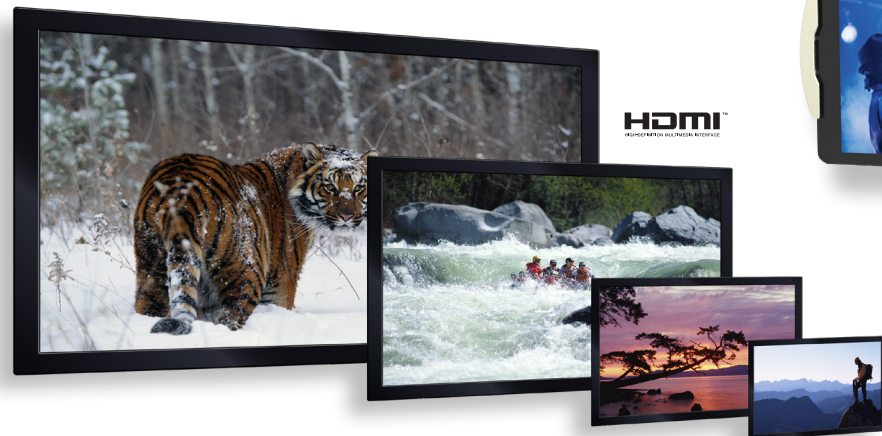
Choose from 24-, 42- and 65-inch high-definition bulkhead displays or cabin-wide 4K displays in sizes from 15 to 75 inches

status display when not in use. Bezels are plateable to match your unique cabin interior.