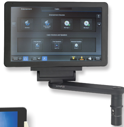
10.6-inch HD personal touchscreen

Venue is designed to support exciting new consumer technologies as they emerge.