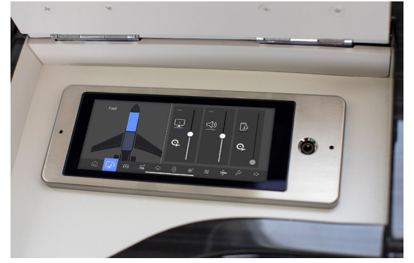
Touch-screen control switch