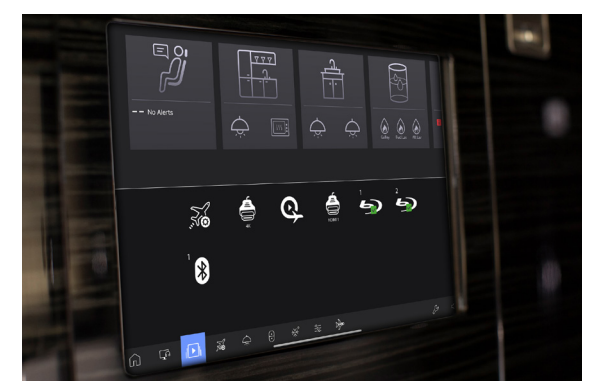
Galley touch screen

From design to installation, life-cycle support and upgrades, Collins provides Venue customers a high-value experience for years. Our dedicated project planning teams collaborate with you to customize the perfect cabin solution for your lifestyle, intelligent self-diagnosing software ensures the system keeps running optimally and 24/7 support helps earn Venue's reputation for unmatched reliability.