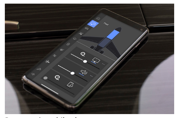
Passenger's mobile phone