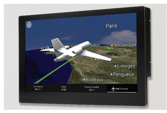
Venue Smart Monitor