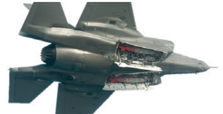
Weapon Bay Door Drive System