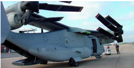
Wing Rotation System