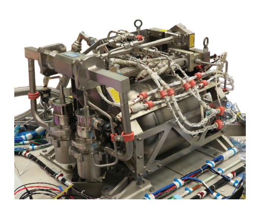
Active thermal cooling for service module