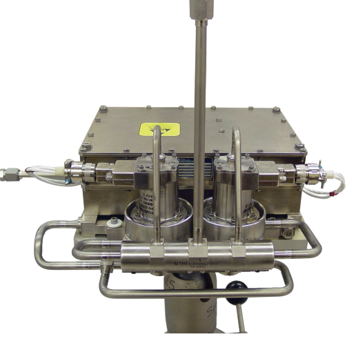
Ammonia pump loop and controller for satellite cooling