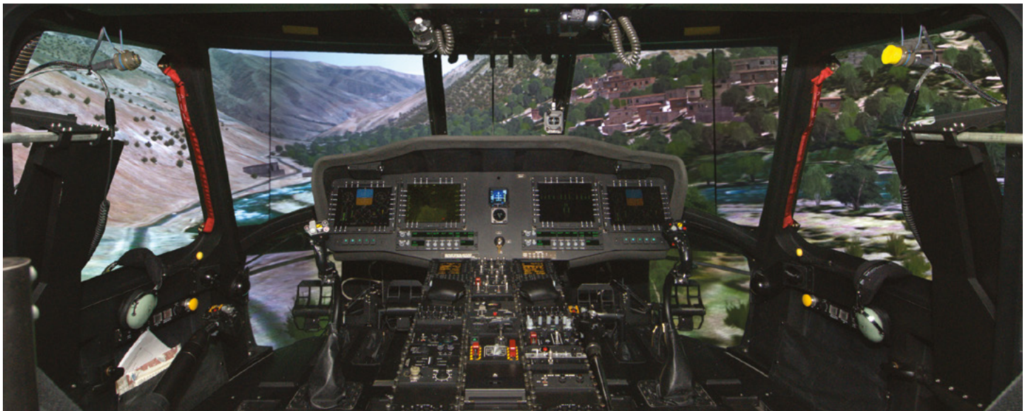
Specifications subject to change without notice.