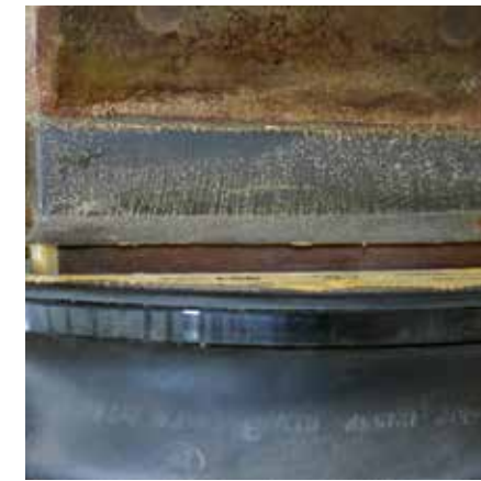
Debonded tail rotor boot cuff