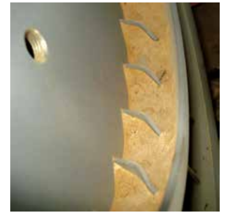
Sand buildup in oil cooler