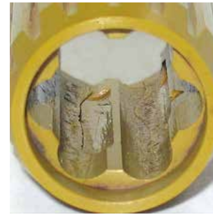
Cracked spline adapter