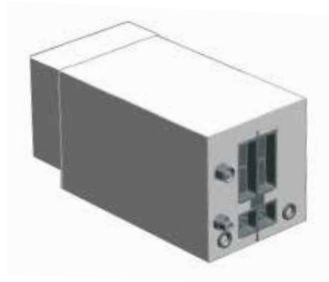
120 kW DC-DC universal high-voltage converter