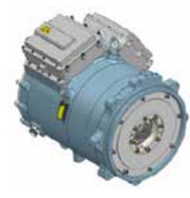
1 MW generator