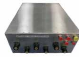
1 MW bi-directional inverter