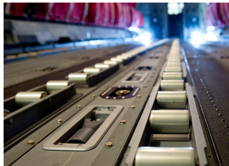
Complete cargo system can be transformed to a troop system in less than 15 minutes