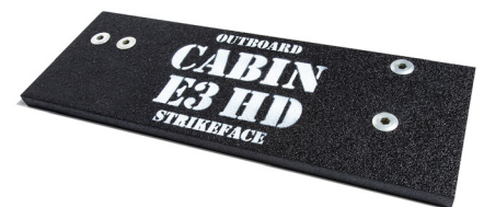
Ballistic panels provide added protection with minimal weight variance over the legacy system

Specifications subject to change without notice.