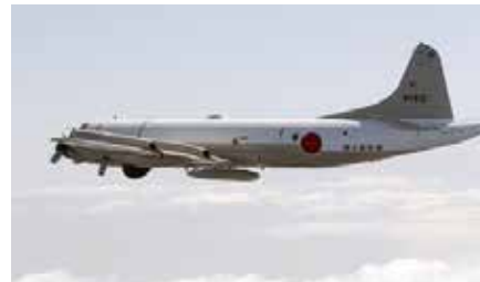
Maritime patrol aircraft