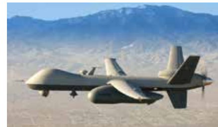
Unmanned aerial vehicle