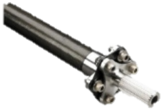
Composites transmission shaft