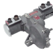
High lift system power control unit actuator