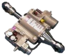
Primary flight controls elevator actuator