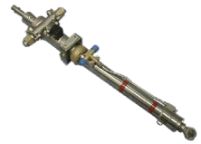
Nacelle actuation thrust reverser