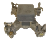
Missile actuation thrust vector actuator