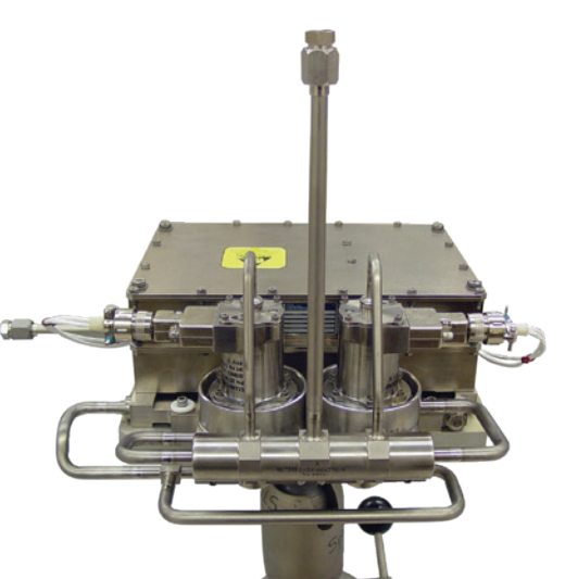
Ammonia pump loop and controller for satellite cooling