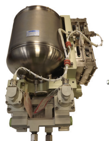
Pump and accumulator system for crewed capsule