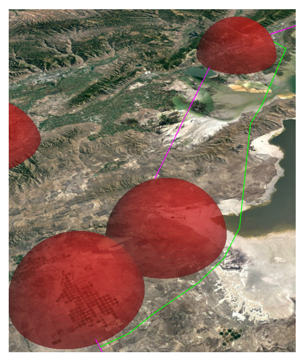
ARR-7000 re-routing around point-radius threats and terrain